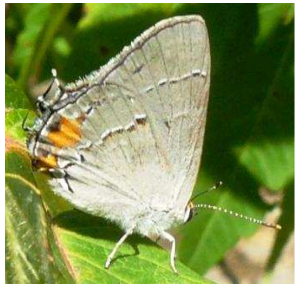
Grey Hairstreak

observed in several locations in good numbers. The Silver Spotted Skipper is generally seen a few times each summer, but this year seemed to be found at many locations. Finally the Grey Hairstreak, normally recorded two or three times a year, was seen much more frequently. This butterfly has two populations in the Kingston region, one resident which feeds on Sweet Fern, and one that migrates up from the south. This second category is generally not observed but this year clearly was present. Also, the resident population did well, and at the Second Depot Lakes area, three broods were observed.