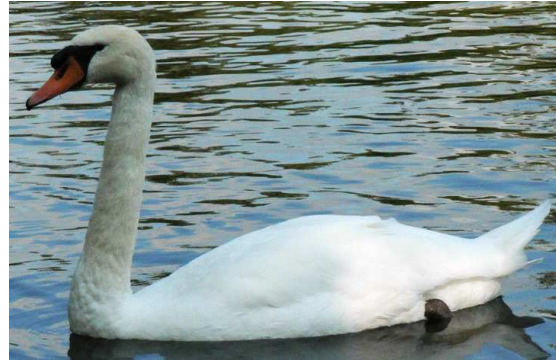
Mute Swan