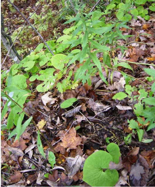
Wild ginger community

We saw Heart-Leaved Aster, Burr Marigold seed, Bittersweet Nightshade (a member of the Tomato family), Dodder (in the Morning Glory family) growing over all the plants nearby, and Wild Grapes as well as Water Hemlock, Baneberry ("Doll's Eyes"), Calico, Horseweed, Ragweed, and Mullein. Among the trees observed were Ash, Maple (both notable for their opposite leaves), Hop Hornbeam, Yellow Birch, Manitoba Maple (or Box Elder), Cedar, and a large Willow. A bank of Grey