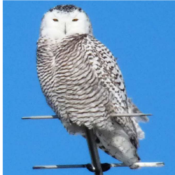
Snowy Owl

Common Nighthawk: peak Aug 17 (45) PEPT, migrants, DO.