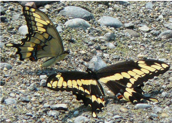
Giant Swallowtails

This was the year of the Giant Swallowtail in the Kingston area. These large showy butterflies were only first recorded in our area in 2006; quite a few were seen in 2008 and 2009, but they were only seen at Prince Edward Pt last year. This year they were very common. Many were seen in gardens in the city, but they were also encountered on the shield all the way from Second Depot Lakes to Charleston Provincial Park.